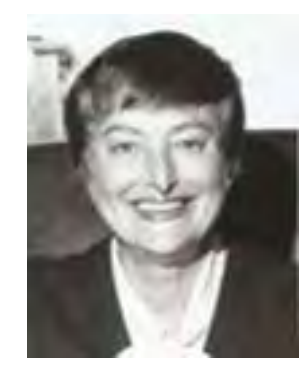
Commissioner Connie McCready sponsored the City of Portland resolution banning discrimination based on sexual orientation in city employment.