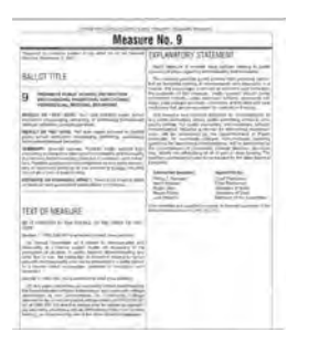
Voters' Pamphlet entry explaining Measure 9